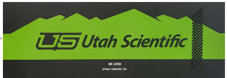
144 x 144 Router Small footprint 4 RU Low power consumption

Perfect for live UHDTV content acquisition, the UHD-12G is fully compliant with SMPTE standards for SDI video. It works seamlessly with the full line of Utah Scientific products including previous-generation SDI routers – further protecting your facility's investment. Also, the UHD-12G can be controlled by any of our current routing control systems.