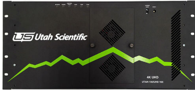
160 x 160 Router Small footprint 4 RU Low power consumption

Here's a router that can handle data rates from SD up to 2160p60 and everything in between, over the same industry-standard coax cabling on which you've always depended. That means simplified installations for signal transport that take up less rack space, need fewer cables to process 4K signals, and reduce operating expenses.