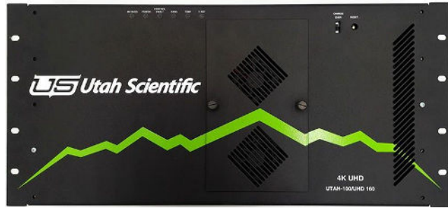
160 x 160 Router Small footprint 5 RU Low power consumption

Here's a router that can handle data rates from SD up to 2160p60 and everything in between, over the same industry-standard coax cabling on which you've always depended. That means simplified installations for signal transport that take up less rack space, need fewer cables to process 4K signals, and reduce operating expenses.